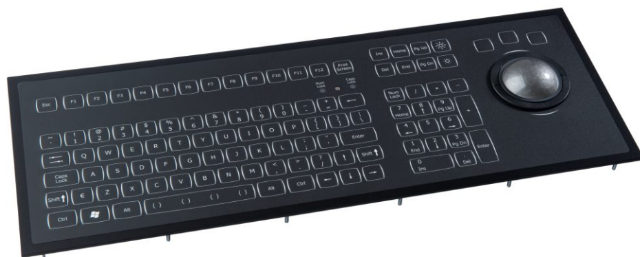
Panel mount with bezel